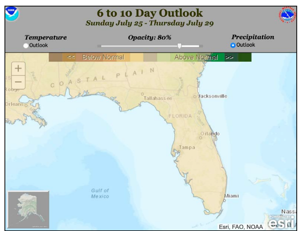
NWS 6-10 day Rainfall Outlook