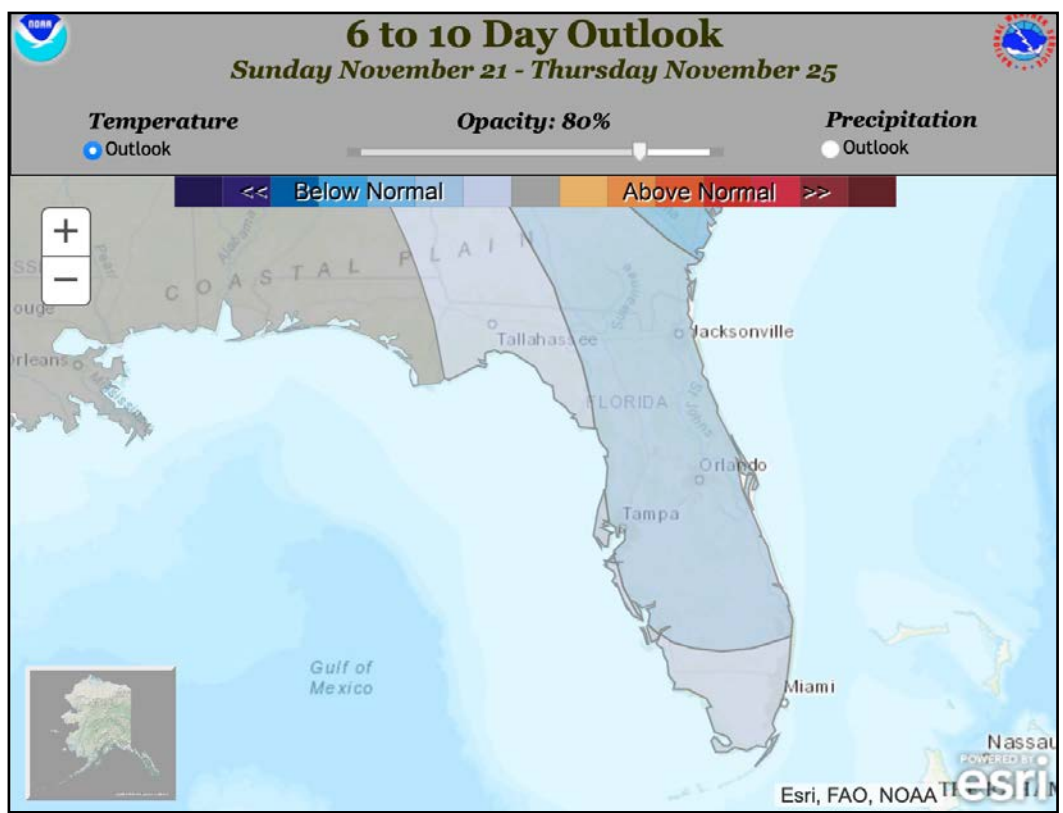
NWS 6-10 day Temperature Outlook